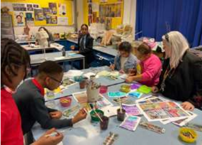
In Art, our future 'gems' were trying a technique called 'wax resist' from the Artist Underwasser

Wednesday 11th October was our annual JQA Open Evening, where we invite parents of students in Year 6 at local primary schools into the Academy to check out what JQA has to offer. It was very well attended and we look forward to many applications to join the school.