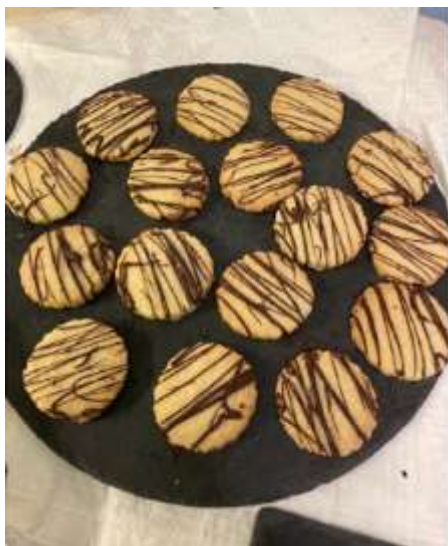
Our Food Technology department offered fresh baked treats!