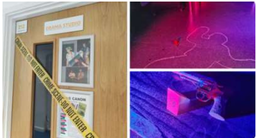
In Performing Arts, future gems were involved in some detective work!